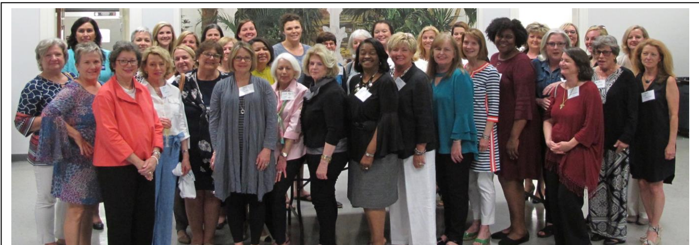
Many of our new members came to the Impact 100 Celebration ready to make a difference in people's lives. Not only did they help celebrate the successful conclusion of the 2018 Membership Drive, but they also signed up for committees and Focus Groups! We're excited to call these philanthropically inclined women "Impact members" and look forward to working together in the year ahead!